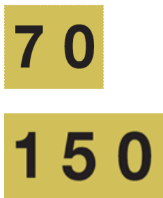
Hide Zero Cards

Repeat using the following ideas: 10 tens, 12 tens, 20 tens, 28 tens, 30 tens, and 37 tens. Or, you can think of your own.